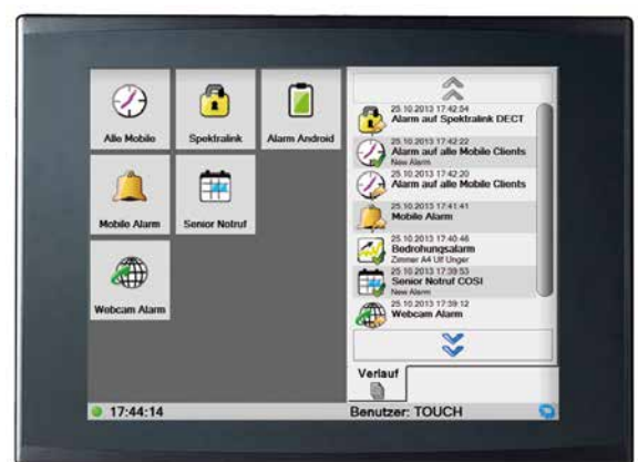
novalert Touch panel

With the „Security“ option your Android smartphone is turned into a BRG-compliant security device which offers you optimal protection when working alone. People who have triggered alerts manually or automatically using the app can be located regardless of whether they are outdoors (GPS) or in a building (Wi-Fi, novalink beacons). With the „Security“ option you can also send night watchmen on monitored patrols.